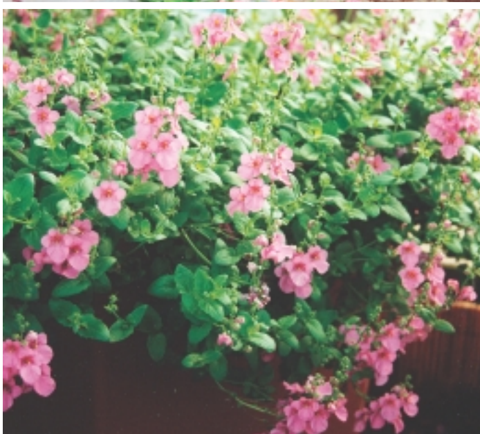
Top: 'Flying Colors Coral'; Bottom: 'Flying Colors Trailing Antique Rose'.